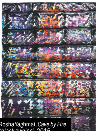
Roshia Yaghmai, Cave by Fire (black awning) , 2016